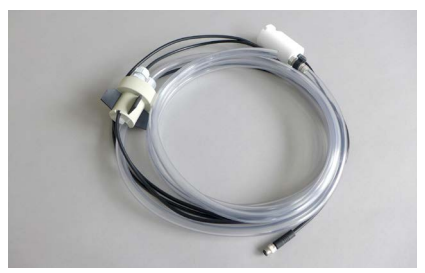
Tank level control 1005098